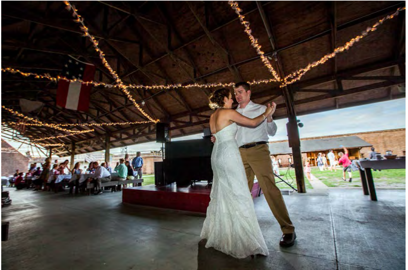
Please come have fun with us!